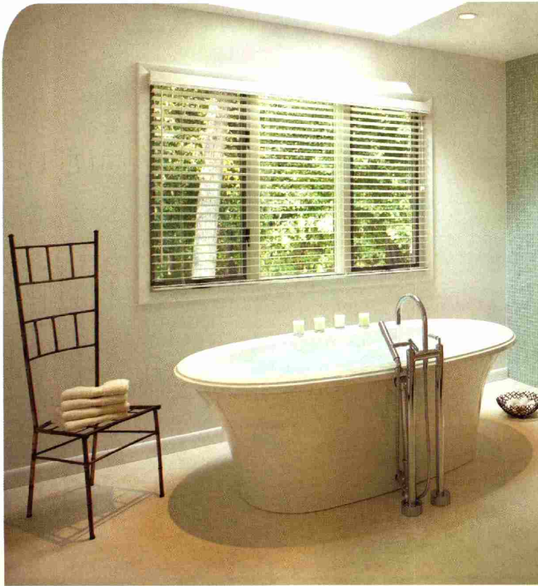
Light-filled and modern, the remodeled master bathroom is a cleaner, minimalist version of its former self. Gone are the pink and white wallpaper, the forlorn vanity and the awkward tub and tub surround. Replacing them are a sparsely elegant bathing area (left), soft white finishes that soothe and a maple vanity (below & bottom) whose bowed front and countertop seem faintly evocative of a tranquil ocean.